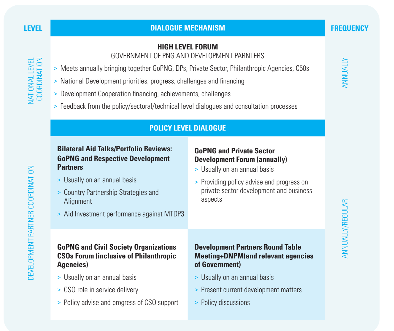
Figure 1: Dialogue mechanism between GOPNG & Development Partners

CSOs will engage with GoPNG and relevant DPs through regular dialogue and consultation with the Department for Community Development, Church and Religion and the Consultative Implementation and Monitoring Council (CIMC) process. CSOs will also serve as domestic and international advocates for development and aid effectiveness, stimulate public debate and improve understanding on these issues amongst stakeholders.